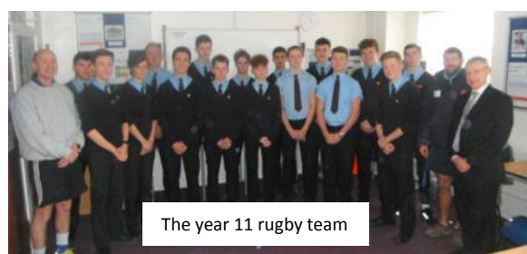
The year 11 rugby team