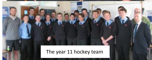
The year 11 hockey team

Sackville students have been achieving well on the sporting front recently as the forthcoming results will show.