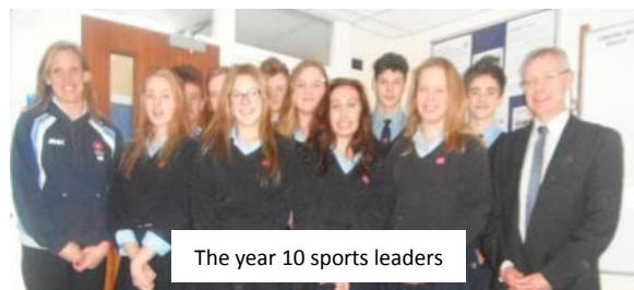
The year 10 sports leaders