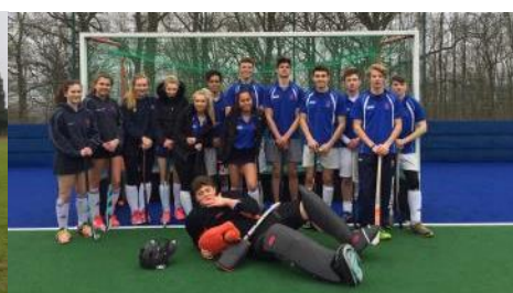
1 st XI Mixed Hockey