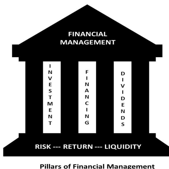
Fig 1.2 Pillars of Financial Management

Take an example of a capital investment decision to be made by an organisation to maximise shareholder value. A corporate may evaluate multiple project options on the basis of net present value and incorporate an appropriate discount rate to factor the risk element. Subsequently financing of these projects need to be worked out and the cost of financing incorporated in the net expected returns for each project being evaluated. Projects must yield the expected returns for the shareholder else the company may reject all projects and return the cash to shareholders in the form of dividends.