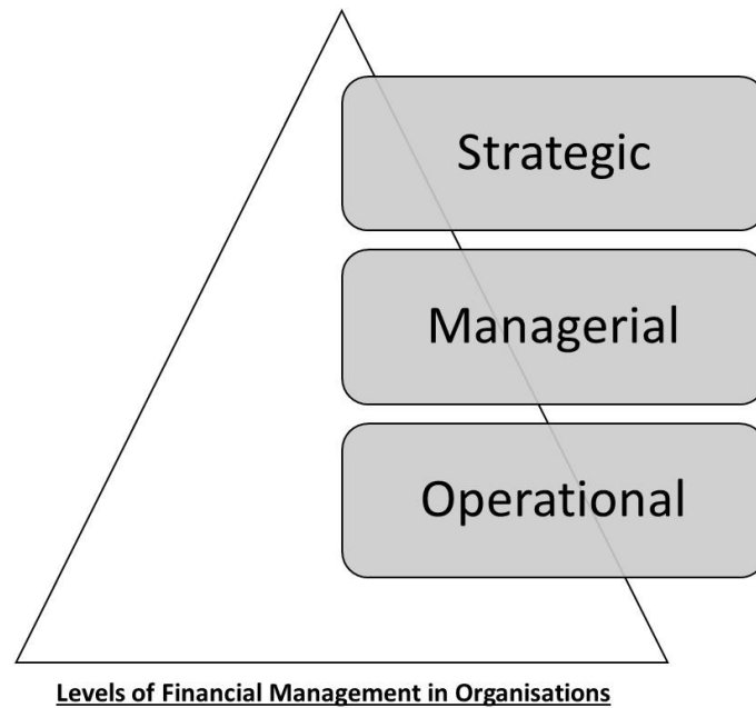
Fig 1.1 Levels of Financial Management

Operational Level – Financial management at the operational level requires managing the firm’s routine financial requirements like working capital, cash flow, repayments, costs etc. This level closely interacts within all the functions including accounts, production, sales etc to manage the financial flows with the company on a day-to-day level.