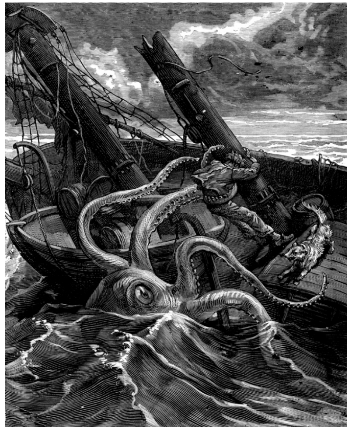
An Infrastructure Plan Embraces the U.S. Congress

The 2015 FAST Act made changes to help RRIF become a more viable financing option. This included creating a new agency within the U.S. Department of Transportation (DOT), the Build America Bureau. One objective of the Bureau was to professionalize the underwriting and management of RRIF, incorporating it into the centralized management of a suite of transportation infrastructure funding tools including TIFIA loans,