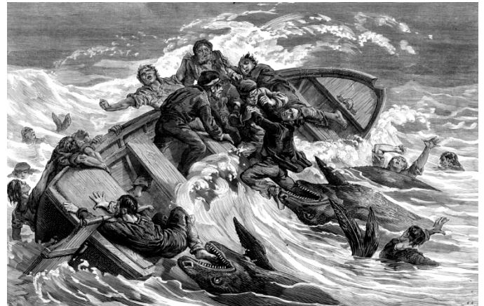
Allegory of the Coming Infrastructure Plan Debate in Congress

could reduce application uncertainty and speed up the process for these borrowers. The Build America Bureau can finalize and pilot this 'RRIF Express' framework in 2018.